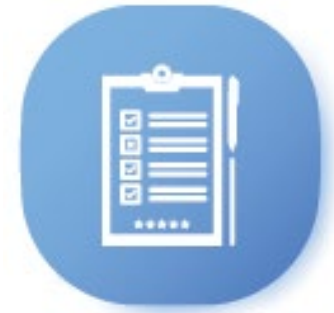
Annual Progress Report