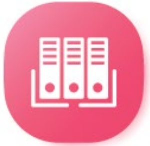
Service Line Inventory