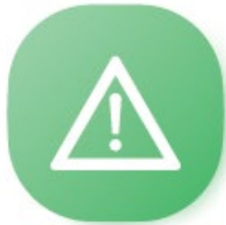
Lead Service Line Notification Form