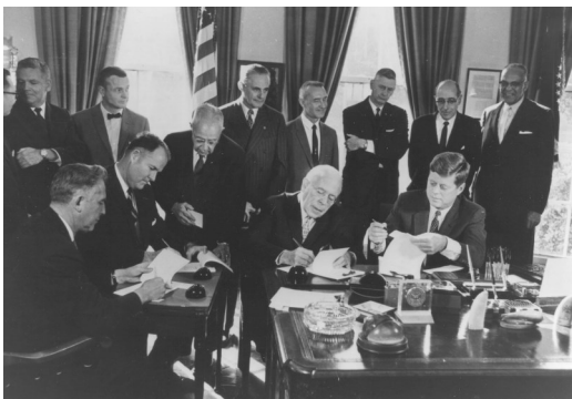
White House ceremonial signing of the Delaware River Basin Compact, Nov. 2, 1961.

A breakthrough in water resources management occurred in 1961 when President Kennedy and the governors of Pennsylvania, New Jersey, New York and Delaware for the first time signed concurrent compact legislation into law creating a regional body with the force of law to oversee a unified approach to managing a river system without regard to political boundaries.