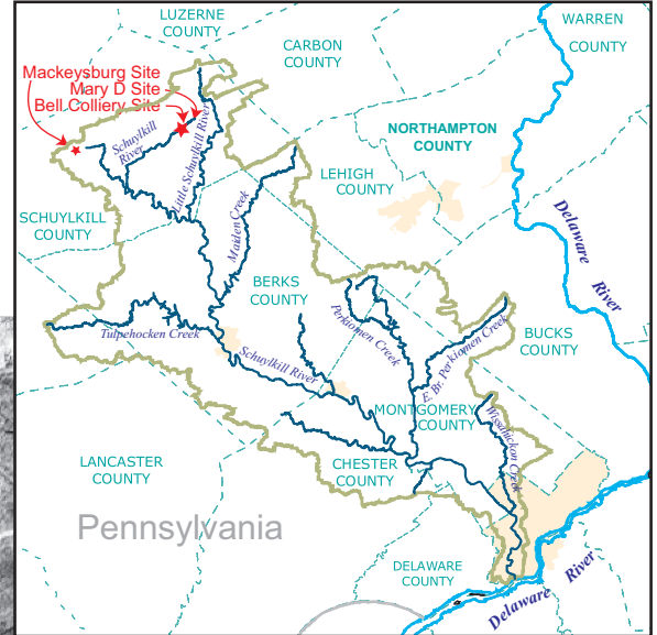
Mary D Ballfields Project

This effort was coordinated by a partnership of organizations aimed at developing new incentives for the construction of AMD treatment facilities. The partnership has been active for over one year, the creation of which was spearheaded by Stell Environmental Enterprises, Inc. Partner organizations include DEP, DCNR, DRBC, SHA, EPCAMR, PALTA, Exelon, Philadelphia Water Department, Schuylkill Conservation District, and Stell Environmental.