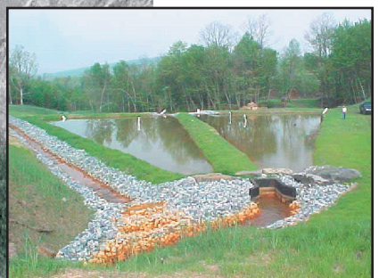
Bell Colliery Treatment System Phase I (photo at right) and Phase II