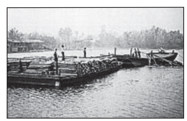
A Delaware River timber raft

It has since become a tradition of the sojourn that "High Admirals" are selected each year as tributes to those who have made outstanding contributions to protect