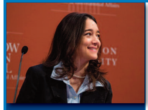
On April 4, Commissioner O'Dowd spoke at the Big Data and Health: Implication for New Jersey's Health Care System conference held at Princeton University.

Under the leadership of the Department, we've also made significant progress in the use of HIT. Three regional planning teams are merging data from public health and hospitals to improve patient outcomes.