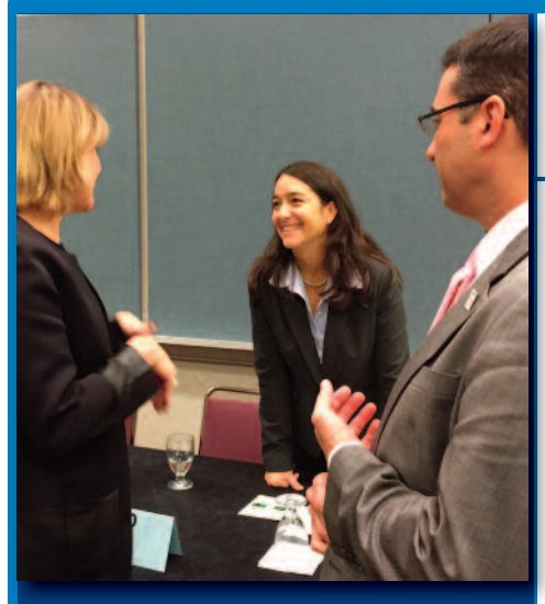
Commissioner O'Dowd talks with Local Health Officers at the NJ League of Municipalities Conference on Nov. 19