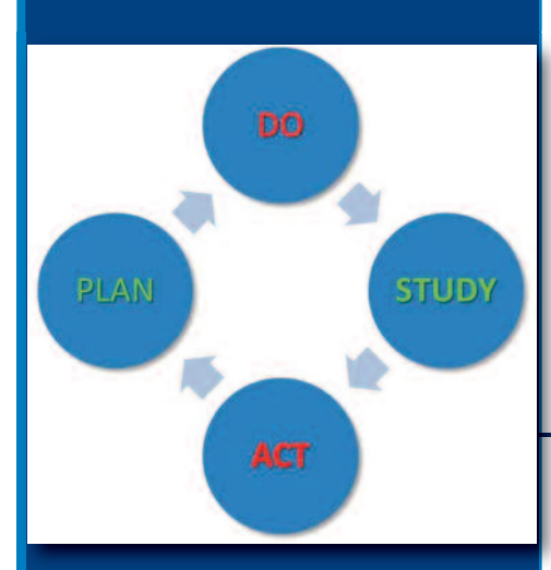
The 'Plan, Do, Study, Act' (PDSA) cycle