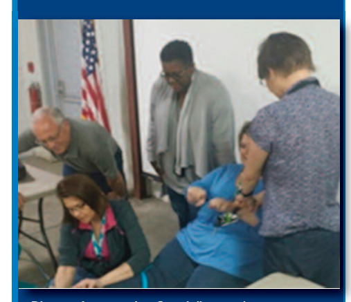
Disease Intervention Specialists undergo phlebotomy training in response to a HIV outbreak in Indiana.