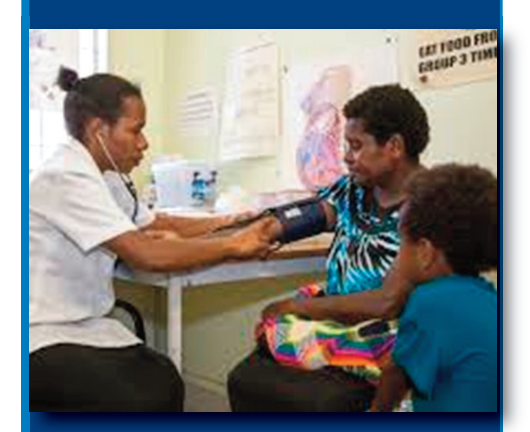
About 178,000 health screenings were conducted in New Jersey this year.