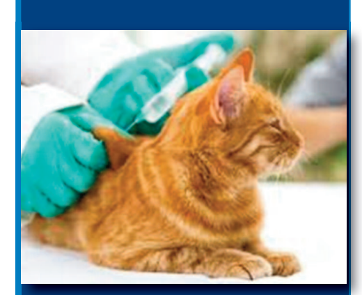
Approximately 72,000 pets were vaccinated in New Jersey this year.