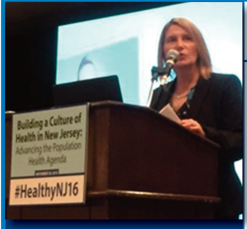
Commissioner Bennett delivered remarks at the Department's Building a Culture of Health conference in Edison.