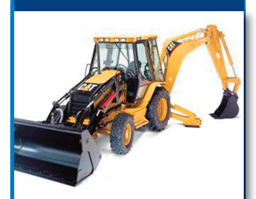
Backhoe loaders are used in a wide array of industries for different tasks.

For more information, visit the North Jersey Health Collaborative's website at <a href="http://bit.ly/2h9FPR3">http://bit.ly/2h9FPR3</a>.