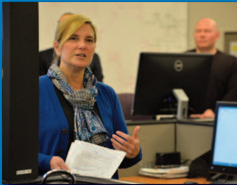
Acting Health Commissioner Cathleen Bennett emphasizes the importance of keeping healthcare data secure.