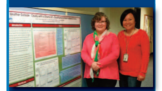
DOH researchers and data specialists revamped emergency department classifications after Superstorm Sandy in 2012.