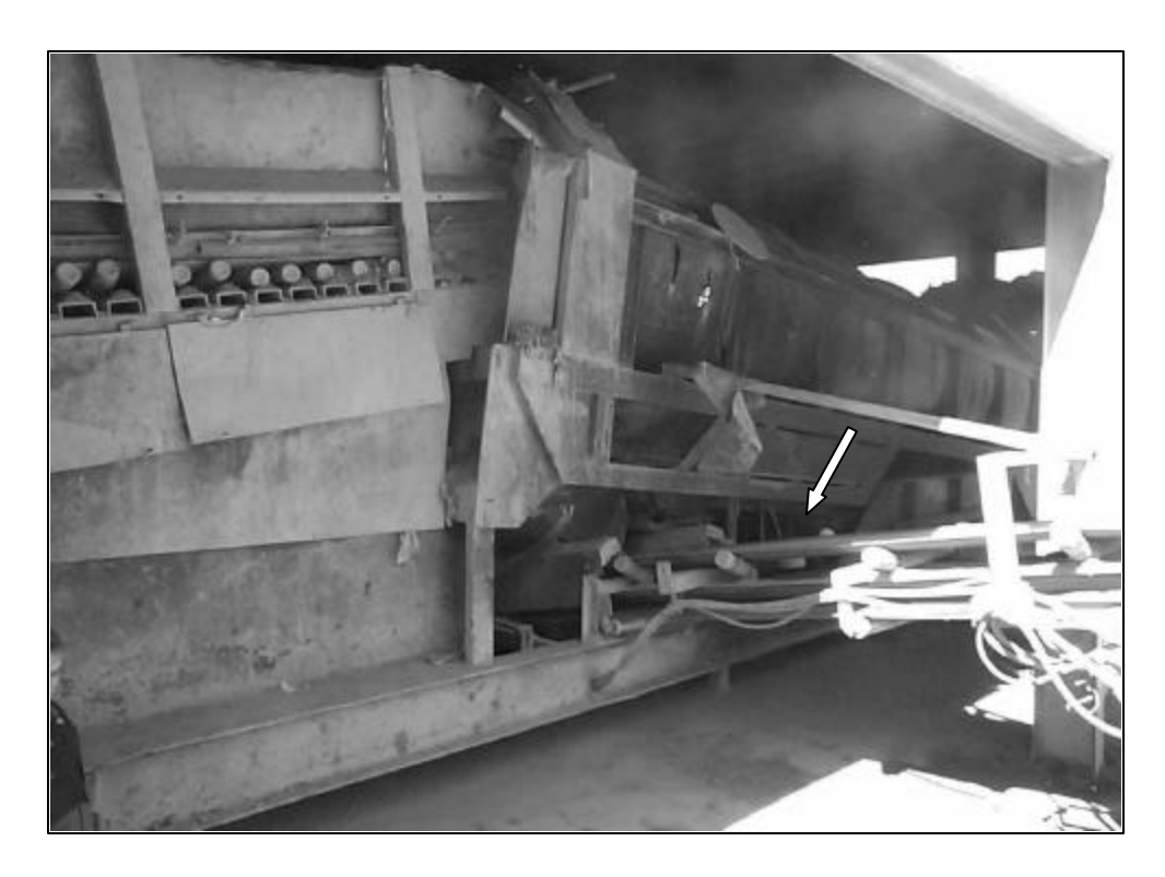
Figure 2 Side of power-screen. Victim was found in area behind the conveyor belts.