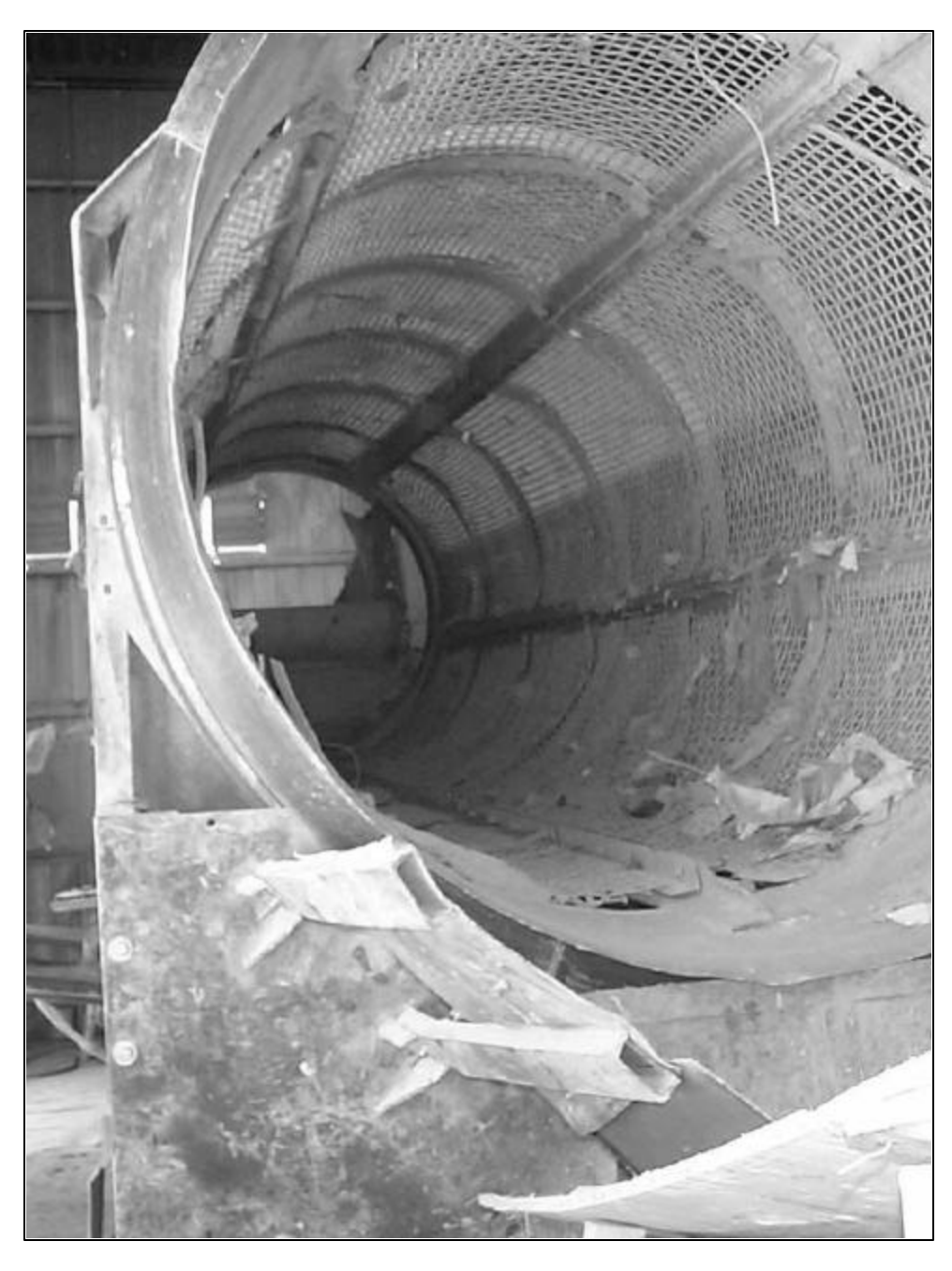
Figure 1 Rear of power-screen machine showing screened drum