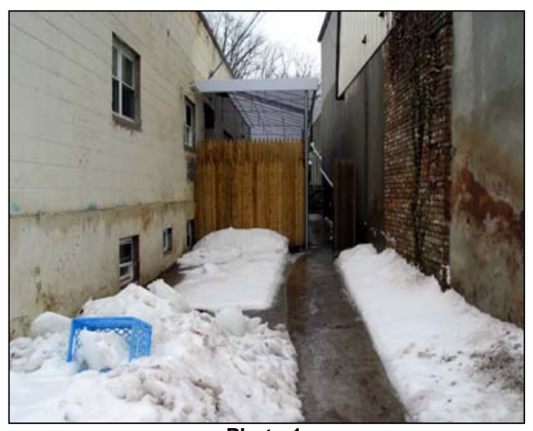
Photo 1 Driveway between two buildings. Incident occurred behind the new fence.