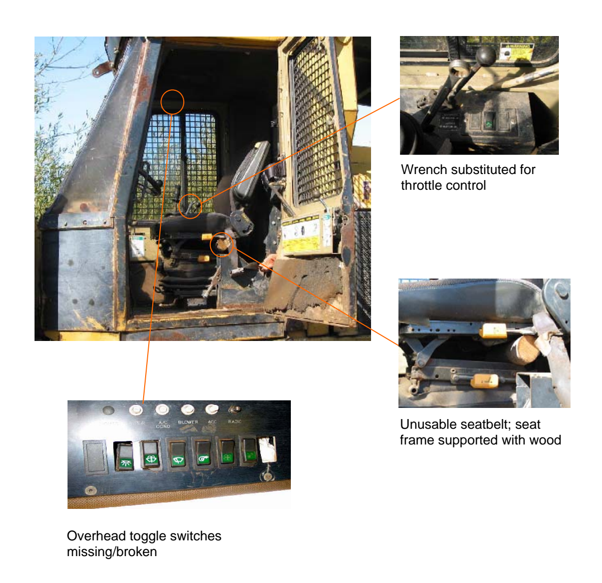
Figure 7. Cab interior of tree-cutting machine.

used to design or modify a written standard operating procedure. Additional information on conducting a job hazard analysis is included in the Appendix.