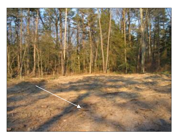
Figure 1. Cleared lot. Arrow indicates approximate lot location where tree struck victim.

follows: the operator positioned the feller-buncher at the tree, the saw blade was engaged, and the tree was cut and collected by the interlocking arms. The cutting and grasping were essentially two simultaneous actions. The feller-buncher was also fitted with a thick, forked extension (see Figure 6) above the interlocking arms that served to maintain a cut tree in an upright position and acted to prevent a cut tree from falling directly backward onto the cab.