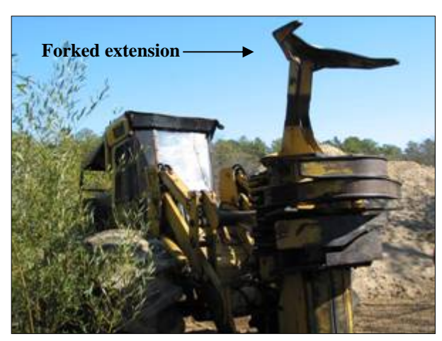
Figure 6. Forked extension to prevent cut tree from falling backwards onto operator's cab

The incident occurred on Monday, February 9, 2004 at about 10:00 AM. It was a mostly clear, cool day with a weather forecast that predicted gusts of wind. The tree-cutting machine operator arrived at the lot and began to cut and stack felled pine trees. The operator was well into the job when the remainder of the crew arrived. Hoping to get a head start on the clearing and cutting of the felled trees, the victim began bucking a felled tree approximately 60 ft from the tree-cutting machine. The machine operator approached a 70-foot tall pine tree with the tree-cutting machine, cut it and attempted to close the "claws" around the tree. However, according to the operator, a gust of wind caught the "twisted" top of the pine, which caused it to become free of the jaws. The cut tree fell uncontrolled at about a 45-degree angle back behind the cab of the machine, striking the victim in the back of the head. The other workers (including the victim's younger brother, also an employee) attempted to provide assistance, and one worker called 911. Police and rescue workers responded. The victim was pronounced dead at the scene by telemetry.