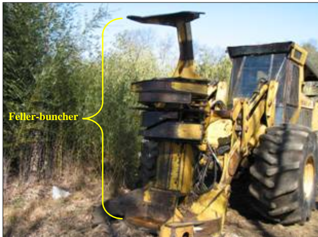
Figure 2 (left): Tree-cutting Machine; Figure 3 (right): Feller-buncher