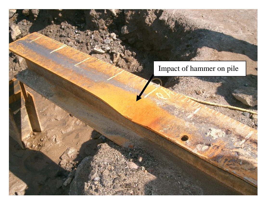
Figure 4: Pile as it rested after crushing victim. Note the muddy conditions.