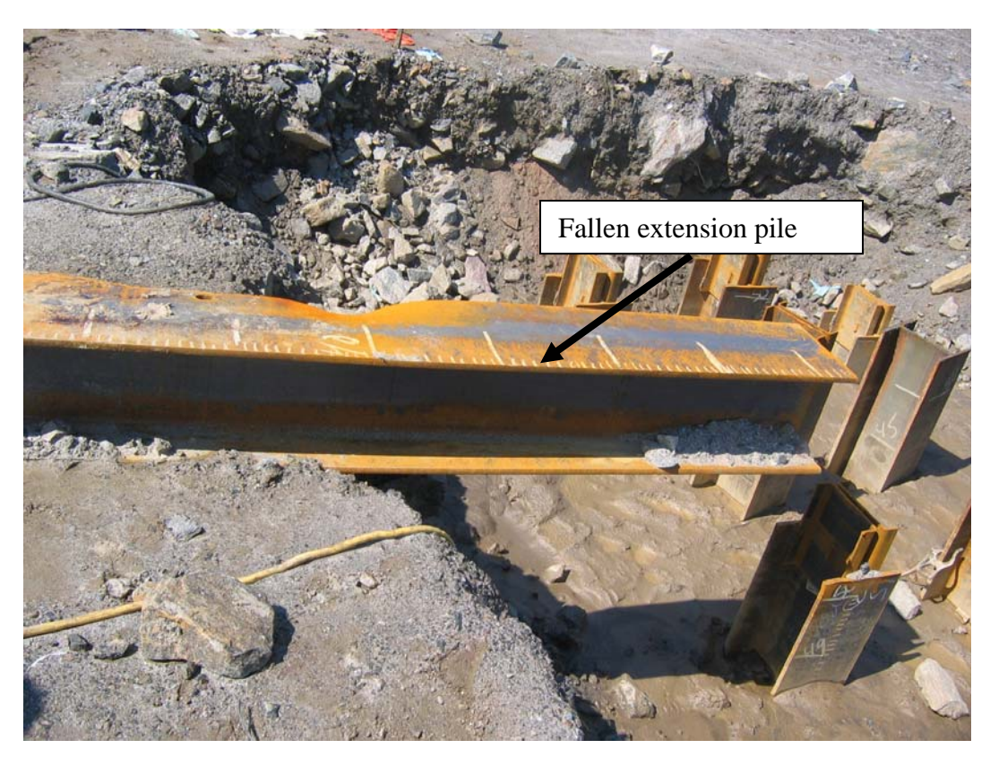
Figure 3: Fallen extension pile.