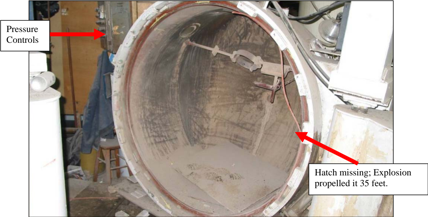
Figure 3. Broken Hatch