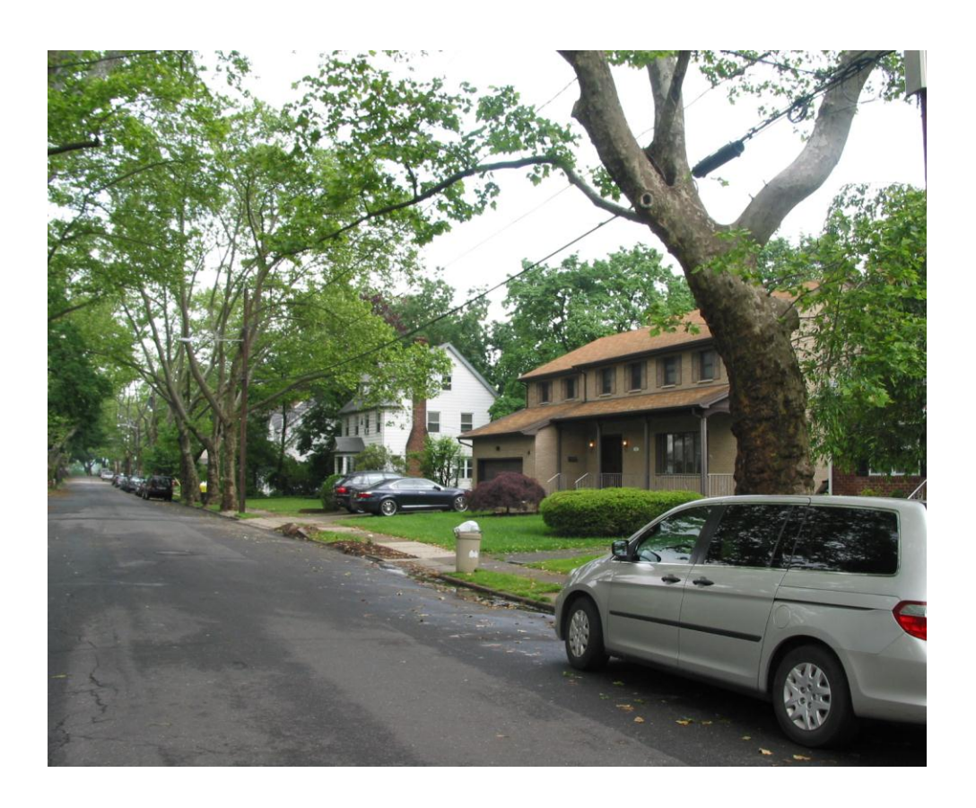
FIGURE 1. Incident site, a heavily treed residential neighborhood in NJ.

crew began to re-grade the soil. When finished, the slab was being walked back into place by the victim and lowered. During this time, for an unknown reason the victim knelt down, perhaps to fix part of the re-grade, and asked the skid-steer operator to raise the slab back up. As the slab was lifted, it swung and hit him in the head. The victim sustained blunt force trauma injuries, including a fractured skull. The victim died minutes after the injury. A crewman called 9-1-1 and the police arrived on the scene immediately.