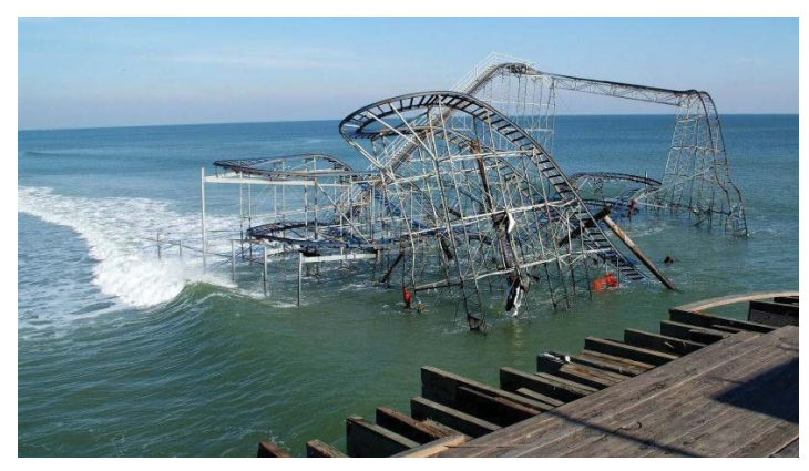
NJ Hurricane Survival Guide