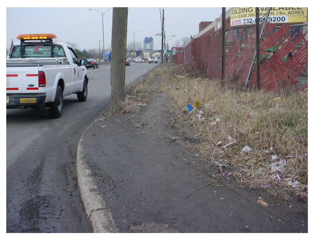
Rt. 1 & 9 Truck SB side looking SB. By Hackensack Ave.