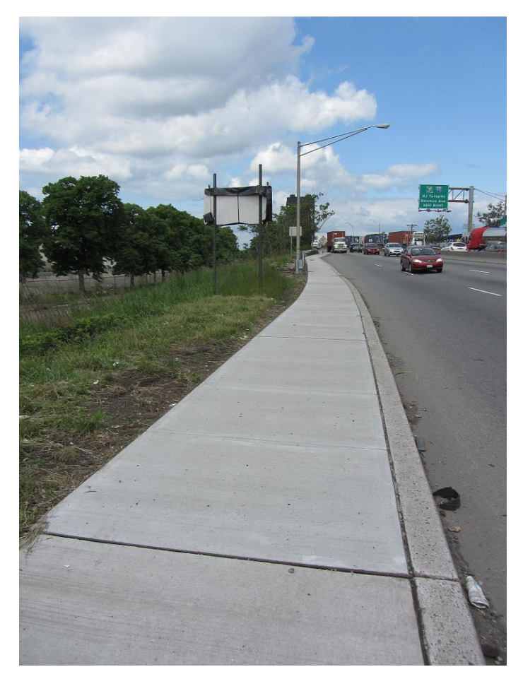
Rt. 1 & 9 Truck NB side looking NB. AFTER