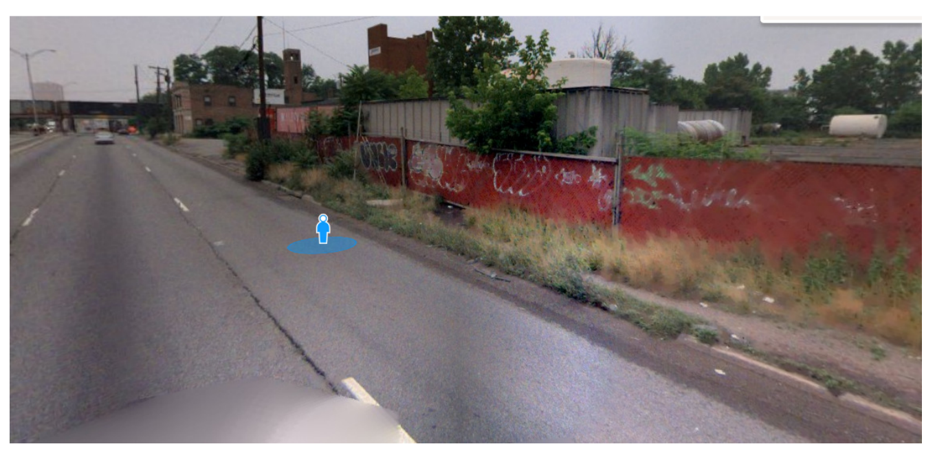
The driveway apron remove/replace was not included in the initial encumbrance.