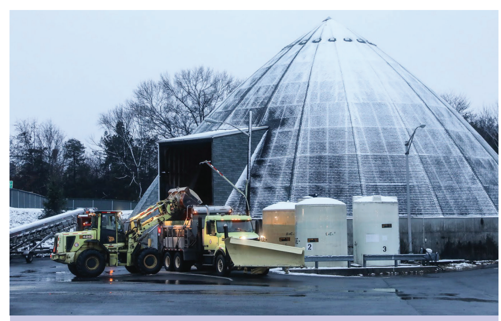
Pictured: NJDOT crews at the Bedminster Yard load salt into their trucks to prepare for a winter storm event.

Most people don't realize, or even think about, what it takes to keep roads safe and passable during a winter storm. They see our spreading and plowing trucks on the road, but don't get a chance to see what goes on behind the scenes. Coordinating the efforts of multiple departments, divisions, contractors, etc. is a tremendous undertaking that our team does very well. I would like to give you a look into the inner workings of NJDOT during a winter