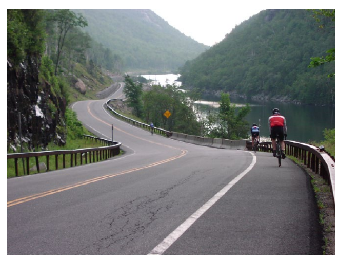
Bicycling on the High Peaks Byway along NYS Route 73 in the Adirondacks

Transportation safety is a vital component to the overall well-being and enjoyment of visitors to New Jersey's scenic byways.