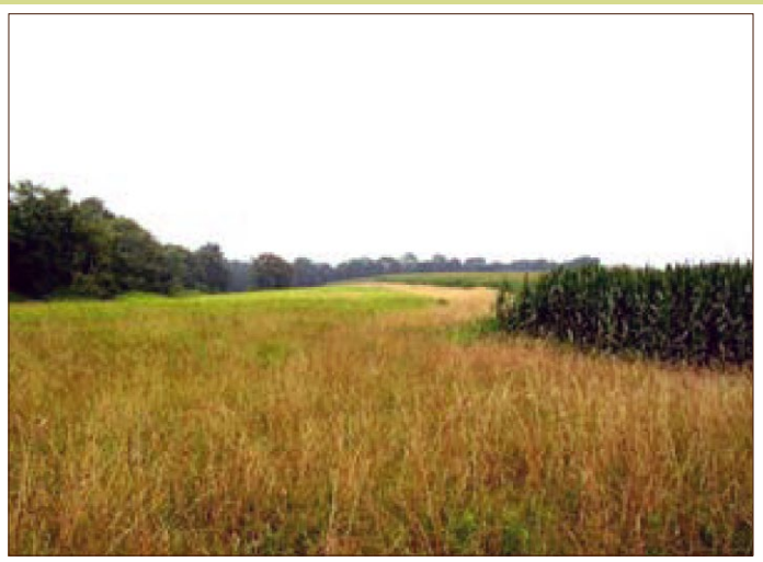
The Frenchtown Greenbelt Preserve is now part of the D & R Canal State Park

The Frenchtown Greenbelt Preserve is now part of the D&R Canal State Park. In late 2006, the Hunterdon Land Trust Alliance completed the acquisition of 150 acres of land within the borough of Frenchtown, preserving the last large undeveloped tract in this small community. The preservation of this land will benefit generations of residents and visitors to come and will help ensure that this byway community retains its charm, and one of its last wild places. It is important to recognize how other organizations along a byway can work toward measures that reinforce a byway's vision, and can support a byway organization's effort to establish and achieve the actions outlined in a CMP. Public and private investment offer implementation opportunities.