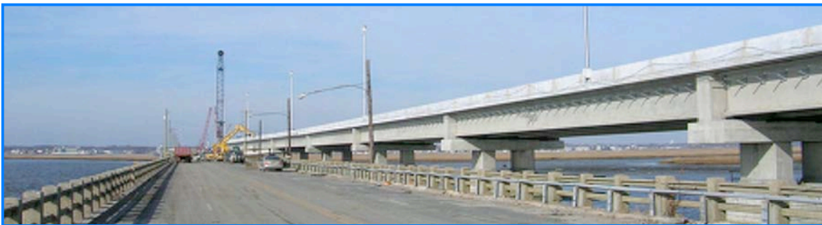
Demolition work on existing Rainbow Channel Bridge with newly constructed Rt. 52 Causeway in the background (Contract A)