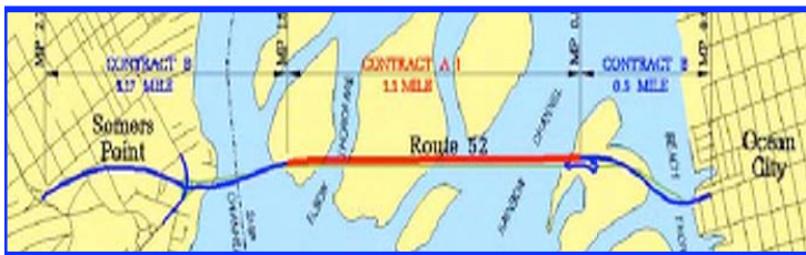
Contracts A and B

The Meeting. The purpose of this meeting is to inform the general public about the NJDOT's Construction Contract A and Design Contract B for the Route 52 Causeway Bridge Replacement and Somers Point Circle Elimination. The meeting will provide an opportunity to inquire about the construction schedule, staging and traffic patterns during Contract A as well as to examine the preliminary engineering plans developed for Contract B. NJDOT staff will be on hand to answer questions.