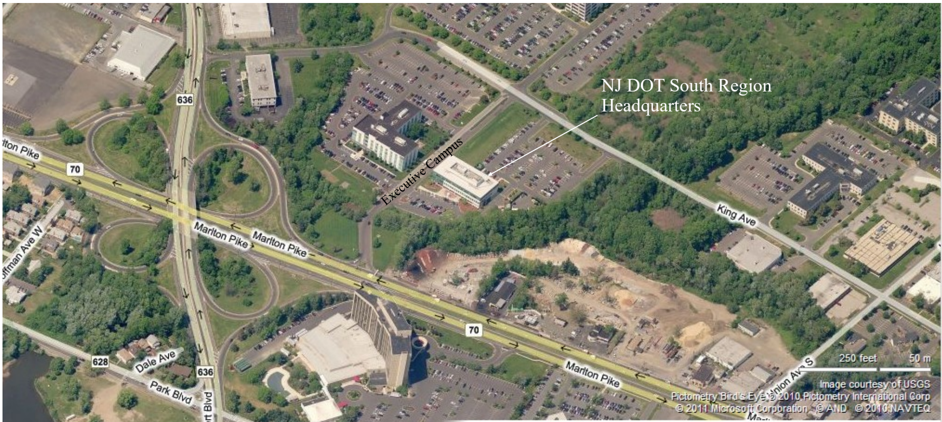
Project Site Location Map NJ Department of Transportation South Region Headquarters